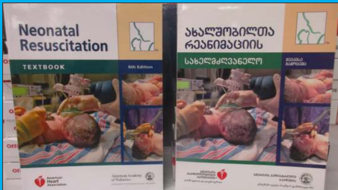
American Academy of Pediatrics text translated into Georgian language

PLEASE Make a $35 tax deductible donation to send a neonatal resuscitation Training textbook to the Georgian physicians in their own unique language.